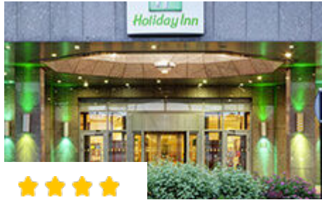
Holiday Inn Moscow Sokolniki