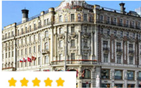
Hotel National, a Luxury Collection, Moscow