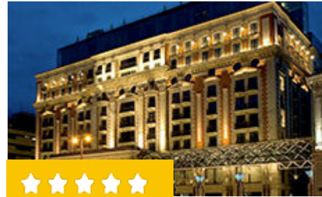
The Ritz-Carlton, Moscow